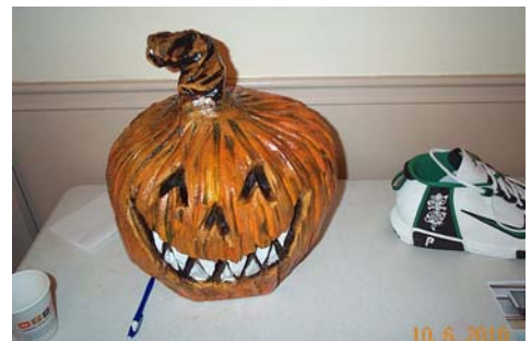
Finished Pumpkin by Mike Higgins