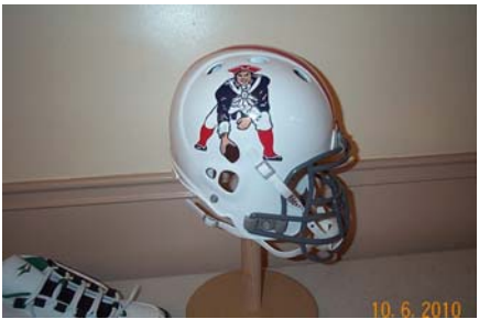
By Walter Powell