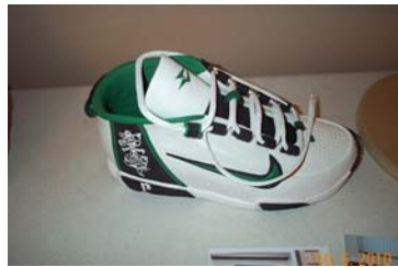
By Walter Powell