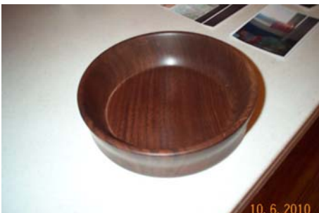
By Ed Charpentier