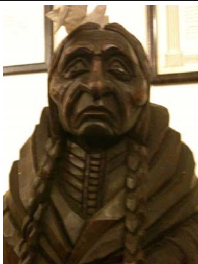
Native American Carving

All in all a very enjoyable presentation for our membership to enjoy!